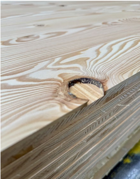
Gaps over 40 mm and fallen out knots