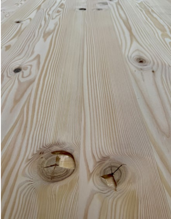
Surface cracks, cracked knots