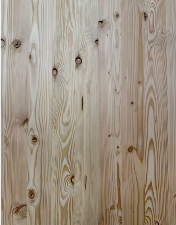
Higher share of sapwood